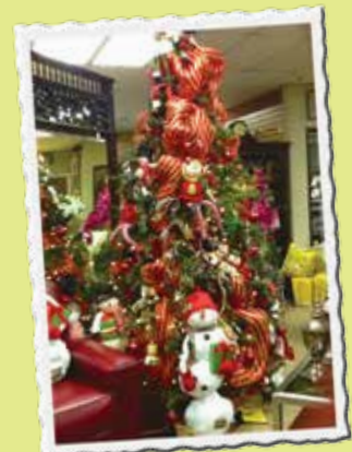
Visit their showroom to enjoy the creativity.