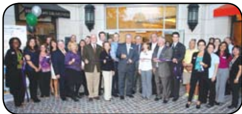
Ribbon Cutting with Kessler Alair Owners, Employees, Dignitaries as well as Rancho Cucamonga Chamber members.

As a business resident and staple in the Upland area for the past 90 years, Kessler Alair now expands its reach with a new location in Rancho Cucamonga. Centrally located in Chaffey Towne Square above the popular Yard House Restaurant, the new Kessler Alair 5,000-square foot office is home to more than 15 agents specializing in an abundant portfolio of insurance services, from automobile and home to worker's compensation and employee benefits.